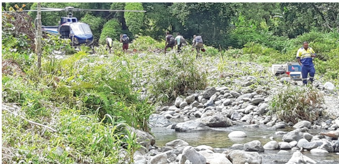
Liwa Creek in Serua, where silver and gold deposits were initially found